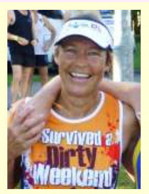
Half marathon. 3rd time. Great event on home soil.