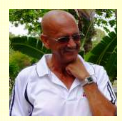
2nd half - trying to improve my time .