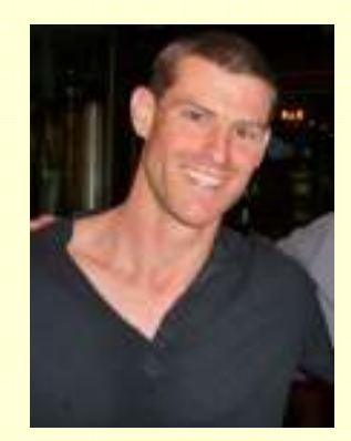
Marathon - : the bigger the challenge the more rewarding.