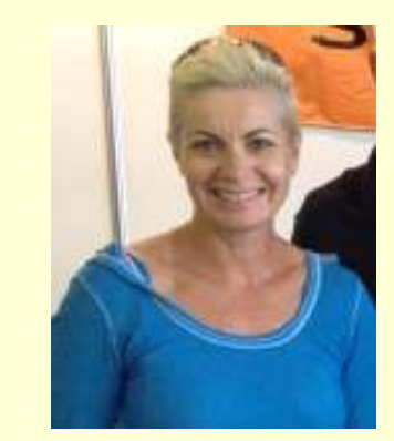
This year it's 10k and I love running on home turf amongst friends .